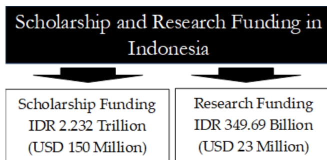
Figure 2: Scholarship and Research Funding in Indonesia 2023